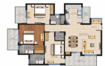
Spacious, 125 m2 living space.