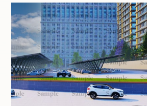
Smart living, electric vehicles prepared.

3 bedroom, 3 bathroom apartment in 22 floor high rise building. Total living space 125 m2, 4 balconies, open floor plan. Fast elevators, 3 meter ceilings, floor to ceiling windows. Fully equipped bathrooms and kitchen, intercom, security, solar panel covered parking space, airconditionings, fenced and secured area. Cafe, restaurant, fitness, mini market, beauty salon.