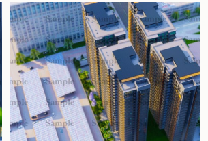
Affordable housing, ecological small footprint.